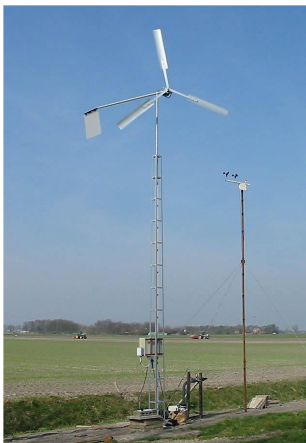
Former VIRYA-3D prototype

The rotor calculations are given in report KD 567. The P-n curves of the rotor for different wind speeds and the lines for different frequencies are given in figure 4 of KD 567. This figure is copied as figure 1. The VIRYA-3.3S has a special direct drive 34-pole PM-generator which generates a frequency of 50 Hz already at a rotational speed of 176.5 rpm. The 34-pole generator is described in the free public report KD 560.