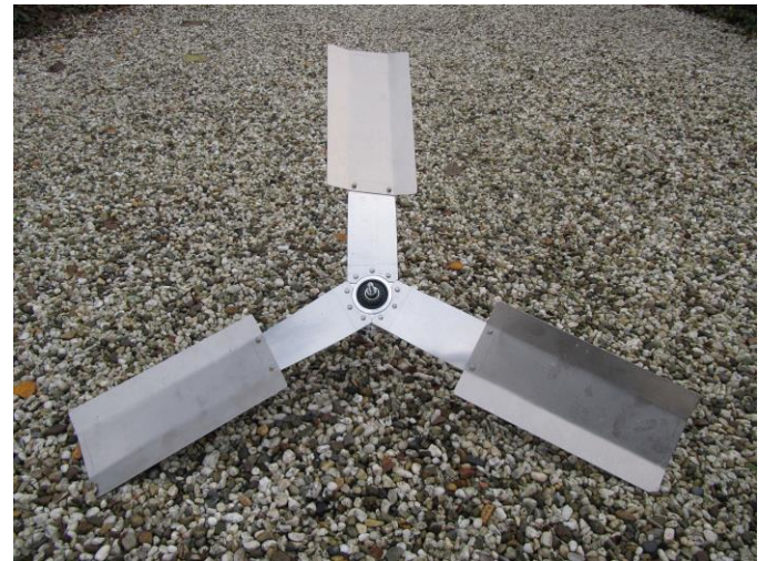
Rotor VIRYA-0.98 + Nexus hub dynamo