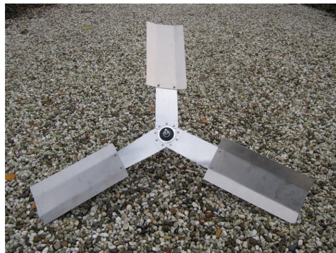
Rotor VIRYA-0.98 + Nexus hub dynamo